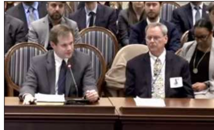
LOCAL 3 County testifies against transportation cuts