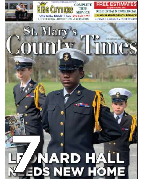
ON THE COVER County's lease with Leonard Hall Junior Naval Academy to end