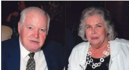
LOCAL 4 Winery founders die