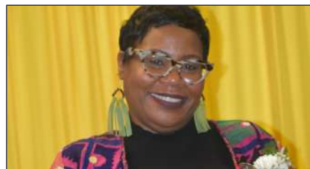
LOCAL 6 Native cosmetologist makes it big in film industry