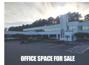
OFFICE SPACE FOR SALE

Charlotte Hall, MD 3 Acres Wooded, Perced