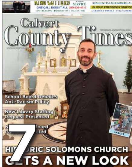
ON THE COVER Our Lady Star of the Sea gets renovations