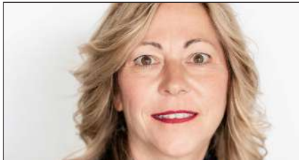
LOCAL 5 Calvert school calendar updated